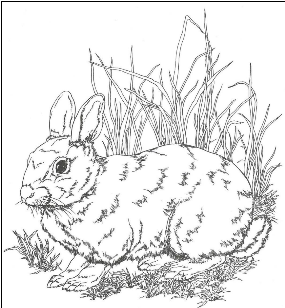
Eastern Cottontail ( Sylvilagus floridanus ). About 17 inches long. Brownish or grayish with white tail. Brushy areas or open forest through most of U.S. (not in northern New England or Far West) and parts of Mexico.

Free coloring pages and book download at www.Gladtodoit.net . Need a pastor? Jim Brewster at Gladtodoit@gmail.com or 202-557-8097.